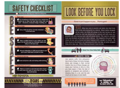
Click image to enlarge.

Every time you park your vehicle open the back door to make sure no one has been left behind.