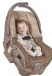
The Cars-N-Kids Car Seat Monitor.

Several products are available to remind a parent if a child remains in a car seat after the car is turned off. One of the more popular is Cars-N-Kids Car Seat Monitor, which turns on upon sensing a child's weight and sounds a lullaby when the car has stopped; it retails for about $40 and is available online.